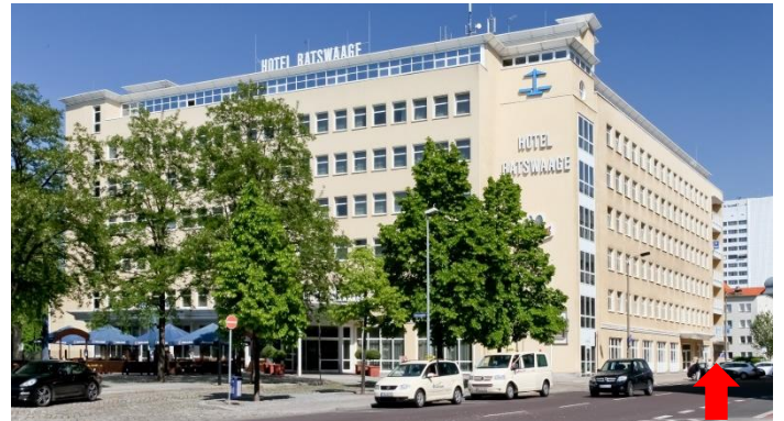
Hotel Ratswaage in Magdeburg