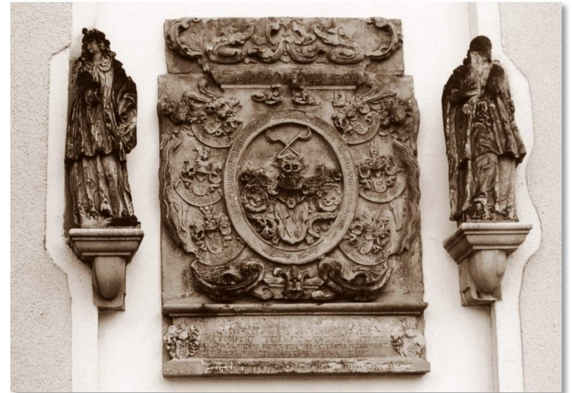
Emblem next to the main entrance

"Renovated anno 1709. This old house destroyed by the gruesome flames, as the city was going down by the hand of the enemy. Stands newly constructed under friendly fate. Spending happiness and keeping its old rights. May it last until the latest years and the guild enjoying the rewards of peace. "